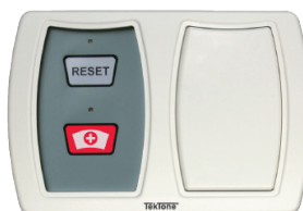
dry contact output module