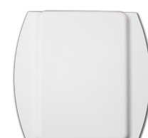
auxiliary input module