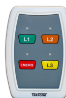
4-button staff peripheral station