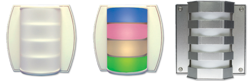
corridor light with 4 programmable-color LEDs, and optional vandal-resistant dome cover (plug-on zone light module also available)