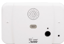
single/dual patient stations