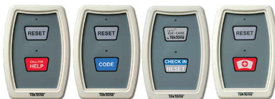
customizable 2-button pull-cord station shown in 4 water-resistant configurations: call for help, code blue, check in / reset, and nurse icon pull-cord