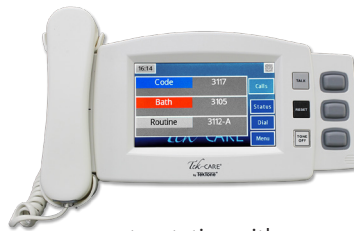
master station with handset and desk mount housing