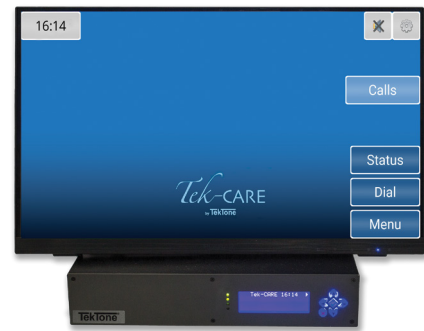
Tek-CARE® Central Equipment with Tek-CARE® Reporting Software