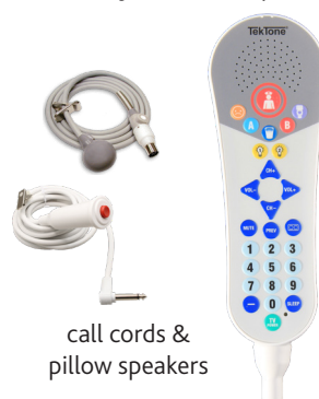
call cords & pillow speakers

(except for paging equipment, call cords, pillow speakers, the Tek-CARE Central Equipment, and refurbished equipment, which have a one-year warranty). See www.tektone.com/warranty.pdf for details.