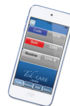
Tek-CARE® Staff App for iPhone, iPad, iPod touch and Apple TV® and Android devices