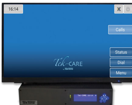
Tek-CARE Central Equipment (NC475DESK pictured)