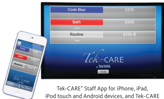
Tek-CARE® Staff App for iPhone, iPad, iPod touch and Android devices, and Tek-CARE App for Apple TV®

TekTone warrants its Tek-CARE500 equipment to be free from defects of material and workmanship under normal use and service for a period of three years from date of delivery.