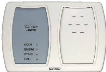
duty station with tone speaker