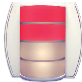
room controller with dome light, 2 LED colors (shown off and on)