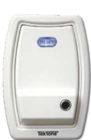
patient station, single ¼" jack