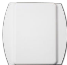
auxiliary input module provides 2 inputs capable of monitoring devices such as door contacts, security panel outputs, and more