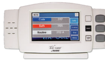
master station with desk mount housing