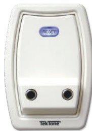
patient station, dual ¼" jacks